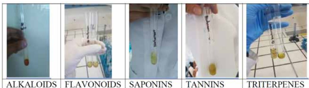
Table 2. Secondary metabolites analysis.

Note: Photographs of the tests carried out in the CIVABI UPS.